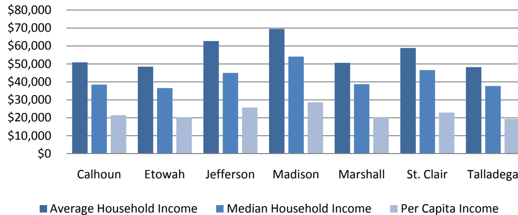
Income For Selected Alabama Counties

Of the seven selected counties, it is interesting to note that the average household incomes range from $48,225 to $69,512, a 44 percent difference. The median and per capita incomes both have a 47.8 percent difference with the median household income ranging from $36,572 to $54,071 and the per capita income ranging from $19,352 to $28,607.